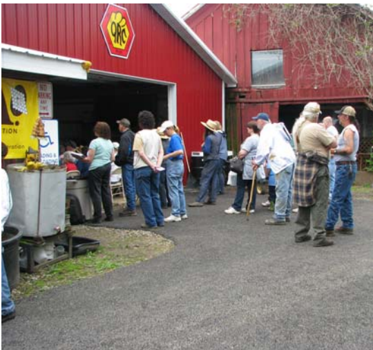
Can you say “overflow” and “standing room only”?