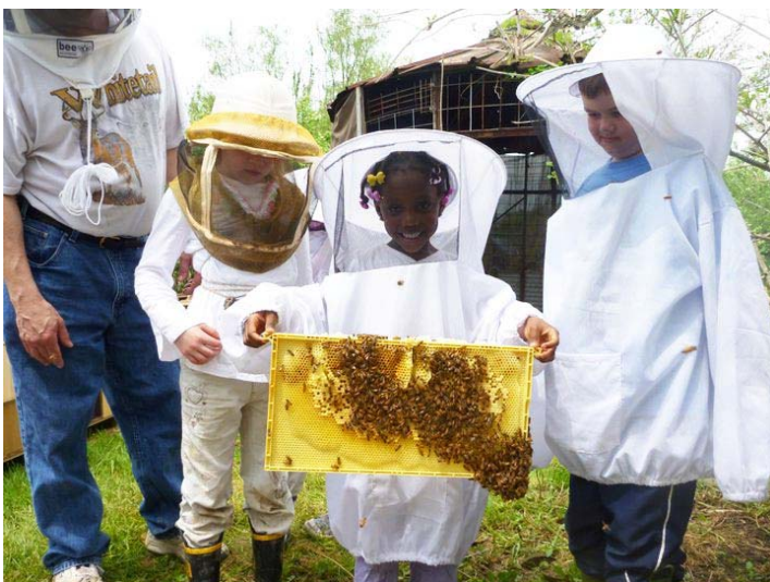
Our young beekeepers, glove free you should note, hold a frame of bees. Now that is the way to do it. You go girls!!