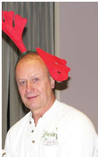
Santa added a new Christmas Reindeer